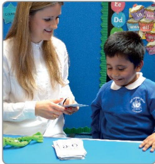
Learning the Speed Sounds in the classroom.