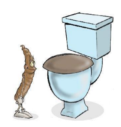
Your child needs to understand that Mr Poo really does want to go in the toilet!