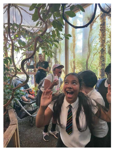
Starting the new academic year

The year 6 children went on a whole range of thrilling and exciting rides at Adventure Island, Southend and visited London Zoo on Friday. The Spider House caused a few screams!