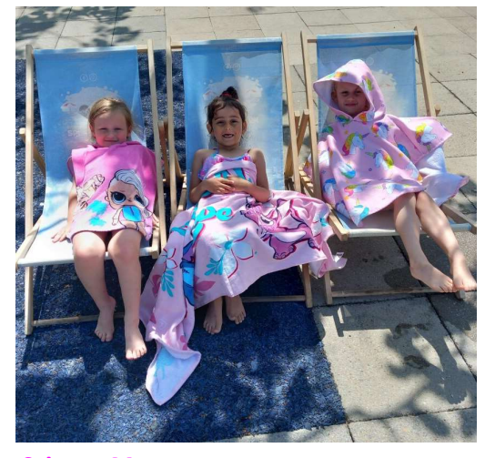
Year 1 - Science Museum

Year 1 had a fantastic time at The Science Museum. In "The Garden", they were able to explore floating and sinking, shadows and reflections and the forces of pulling and pushing. They also got to create symmetrical images and patterns in "The Pattern Pod".